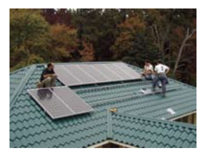
Builders installing photovoltaic solar electric system.

The Solar Gross Receipts Tax Deduction is a tax deduction for businesses from the sale and installation of solar energy systems. A solar energy system is an installation that is used to provide space heat, hot water or electricity, net metering, solar panels, dark colored water tank, non-vented trombe wall, and all equipment necessary for the installation and operation of the solar energy system. The Solar Gross Receipts Tax Deduction will be implemented on July 1, 2007.